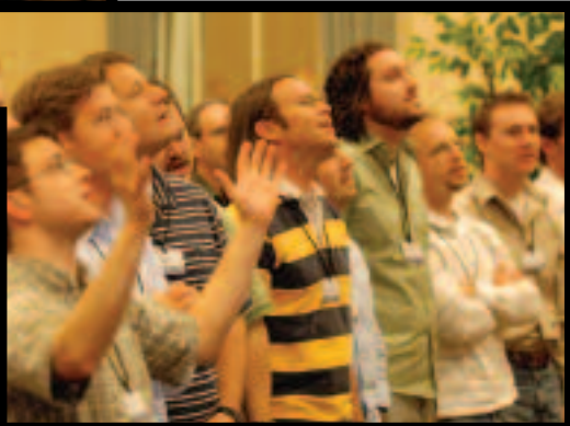
Leaders of Tomorrow: Calvinist theology has spread as pastors train in schools like Southern Baptist Theological Seminary and network at conferences such as Together for the Gospel .

lenges only intensified his study of Reformed theology. He became emboldened to persuade others.