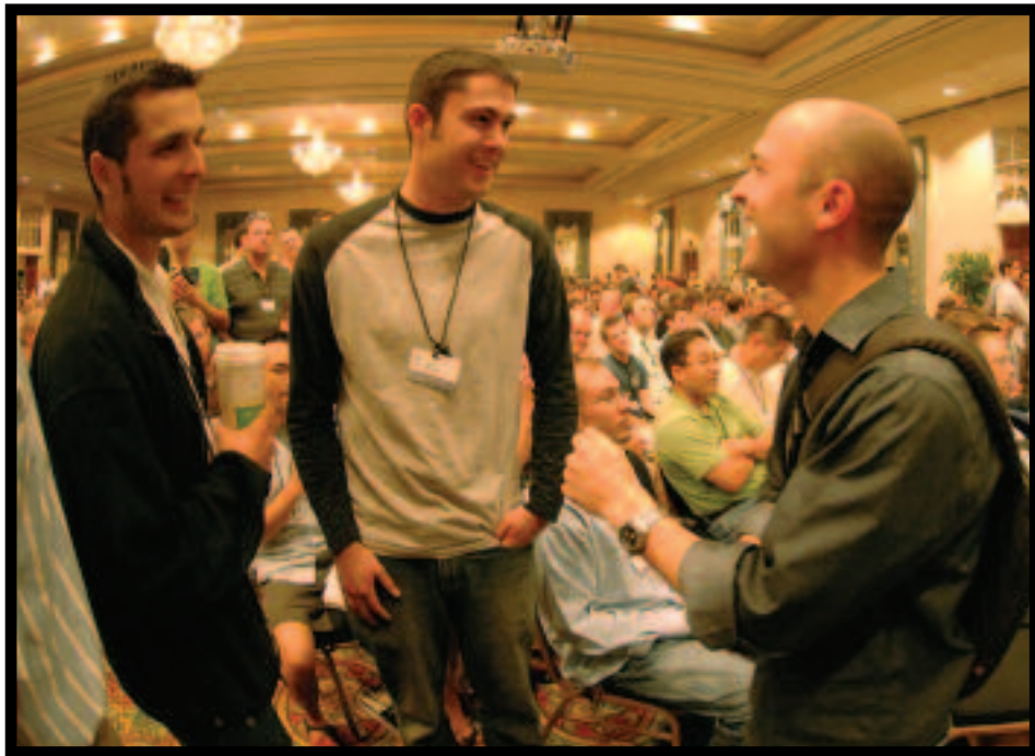
Popular Pastor: Joshua Harris (right) describes his approach to theology as ‘humble orthodoxy.’

Harris’s response is anything but uncommon in evangelical history. Reformed theology has periodically boomed and busted. Calvinists have always inspired foils, such as Jacob Arminius. The Dutch theologian argued that God frees up human will so people can accept or reject God’s offer of salvation. That debate prompted his critics to respond with TULIP. Reformed theology waned during the Second Great Awakening. Most recently, Calvinism has played second fiddle to the charismatic and seeker-sensitive/church-growth movements, all of which downplay many