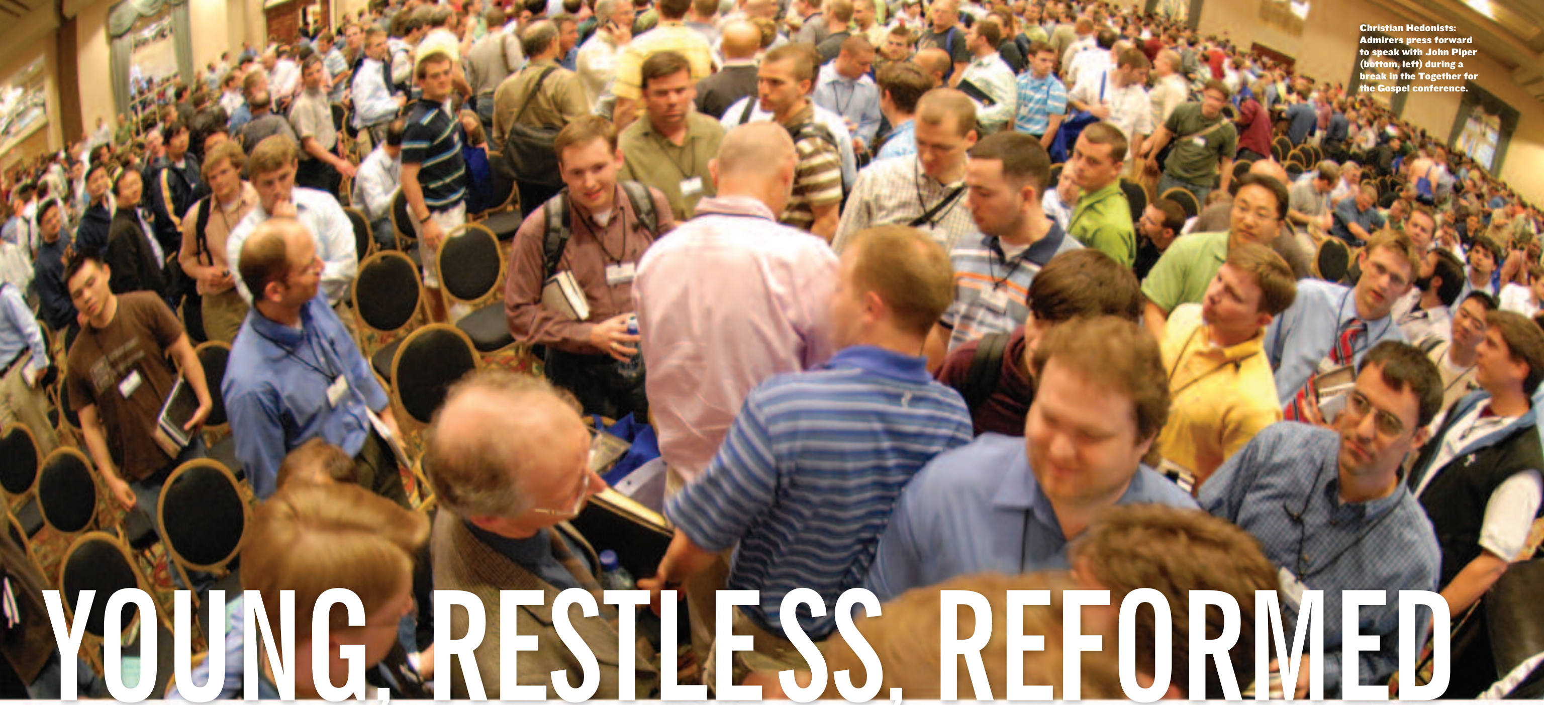
Christian Hedonists: Admirers press forward to speak with John Piper (bottom, left) during a break in the Together for the Gospel conference.